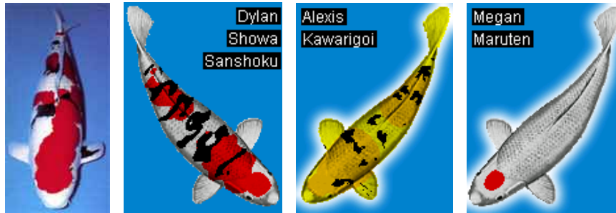
Fig. 1. Examples of real koi (left) and three digi-koi bred by test users of our game (right). The koi's name and classification are displayed in an upper corner of the screen.

ended and can be played by a sole participant at any time and at irregular intervals, e.g., while commuting. However, the ability to trade koi with other players via SMS messages adds an important social element to the game.