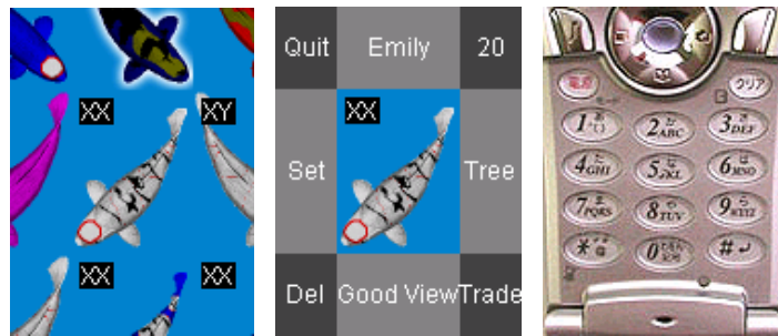
Fig. 2. Discrete panning with partial context (left), the KeyPadPie menu (middle), and the Mitsubishi Electric J-D05 J-Phone keypad (right).

The emphasis on the fiscal facets of the game and the fanciful representation of the fish separate Alien Fish Exchange from digi-koi. Perhaps the most successful example of this genre is CyberLife Technology's Creatures [7], a suite of breeding and nurturing software for the PC. Creatures is similar to digi-koi in that there are few set goals and they are both largely self-directed experiences. Both simulations include a large set of genes that result in a large number of physical variations. Unlike digi-koi, Creatures focuses largely on the nurturing of pets. Players direct the development of their creatures over time by interacting with them. Digi-koi places more weight on the breeding process, and employs a more realistic breeding simulation than does Creatures .