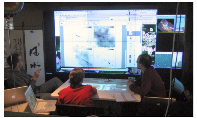
Figure 1. Astrophysicists meeting in the WeSpace.

We present our research of a multi-surface collaboration space called WeSpace, a general-use tool for workplaces in which simultaneous visual exploration rendered from multiple data sources by multiple people is a crucial part of the work-flow process. WeSpace is the outcome of close collaboration between our research team and a population of scientists - astrophysicists from the Harvard Smithsonian Center for Astrophysics (the CfA). It is designed to enable modern day-to-day spontaneous collaborative sessions that are mediated and augmented with computational display devices. We report our year-long effort, starting with a period of ethnographic studies, utilizing a combination of Contextual Field Research (CFR) and intensive interviews, to iterations of design and development, and final results of actual user evaluation.