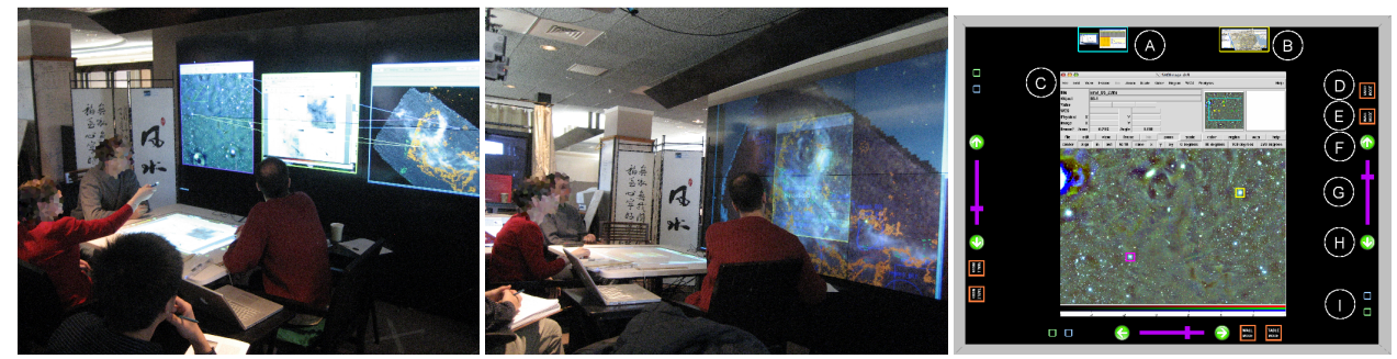
Figure 3. LivOlay in use. ( left ) Linked view of 3 registered images. ( center ) Overlapped view of the same 3 images. ( right ) A screen shot of the multi-touch tabletop ((A) Portal icon to Layout Manager, (B) Portal icon to LivOlay, (C) an astronomical data viewer (DS9) image to be overlaid, with registered points displayed, (D) wall mode switch, (E) table mode switch, (F,H) load next/previous application, (G) transparency control slider, (I) unused registration pins, pick up and drag to target position to register a point.)

LivOlay we emphasizes the role of the interactive table as the command center in the multi-display environment. Identical toolbars, are designed and displayed along each edge of the table to ensure egalitarian input (Figure 3 right). To register a point in one application, pick a pin on the toolbar, and drop it on the target position. The transparency of the current application in the overlapped visualization is controlled by tapping or sliding the slider in the toolbars. Also, a "Table Mode Switch" button appears in each toolbar allowing users to switch to or out of the overlapped view of those applications on the table. When the table is in the overlapped view, it's synchronized with the wall display: visual explorations, such as zoom, pan and transparency change are reflected on both surfaces. With a stylus, users are able to annotate directly on the overlapped visualization displayed on the table.